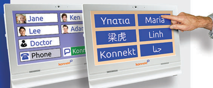
Multi-language support and customisable screen

Try it for 30 days. FULLY PERSONALISED FOR YOU!