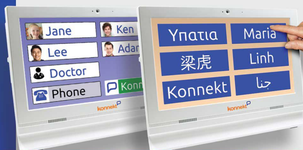
Multi-language support and customisable screen

Try it for 30 days. FULLY PERSONALISED FOR YOU!