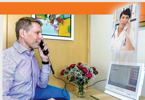
Standard phone calls, with automatic captions