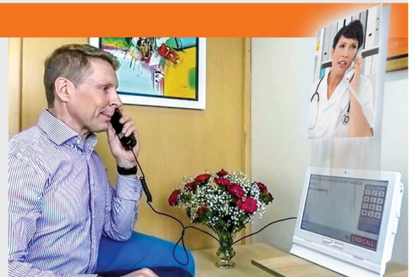
Standard phone calls, with automatic captions