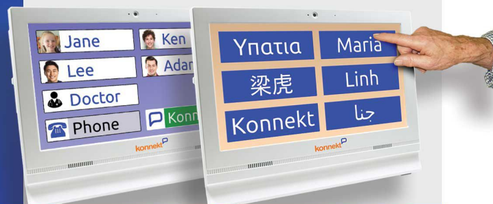
Multi-language support and customisable screen

Try it for 30 days. FULLY PERSONALISED FOR YOU!